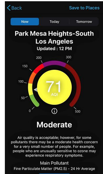
View AQI levels from more than 1,200 distinct locations

The South Coast AQMD app continues to feature detailed, interactive maps of the South Coast Air Basin and Coachella Valley showing real-time and forecasted air quality and weather conditions. Users can also find alternative fueling locations, South Coast AQMD advisories, announcements, public events, meetings and workshops.