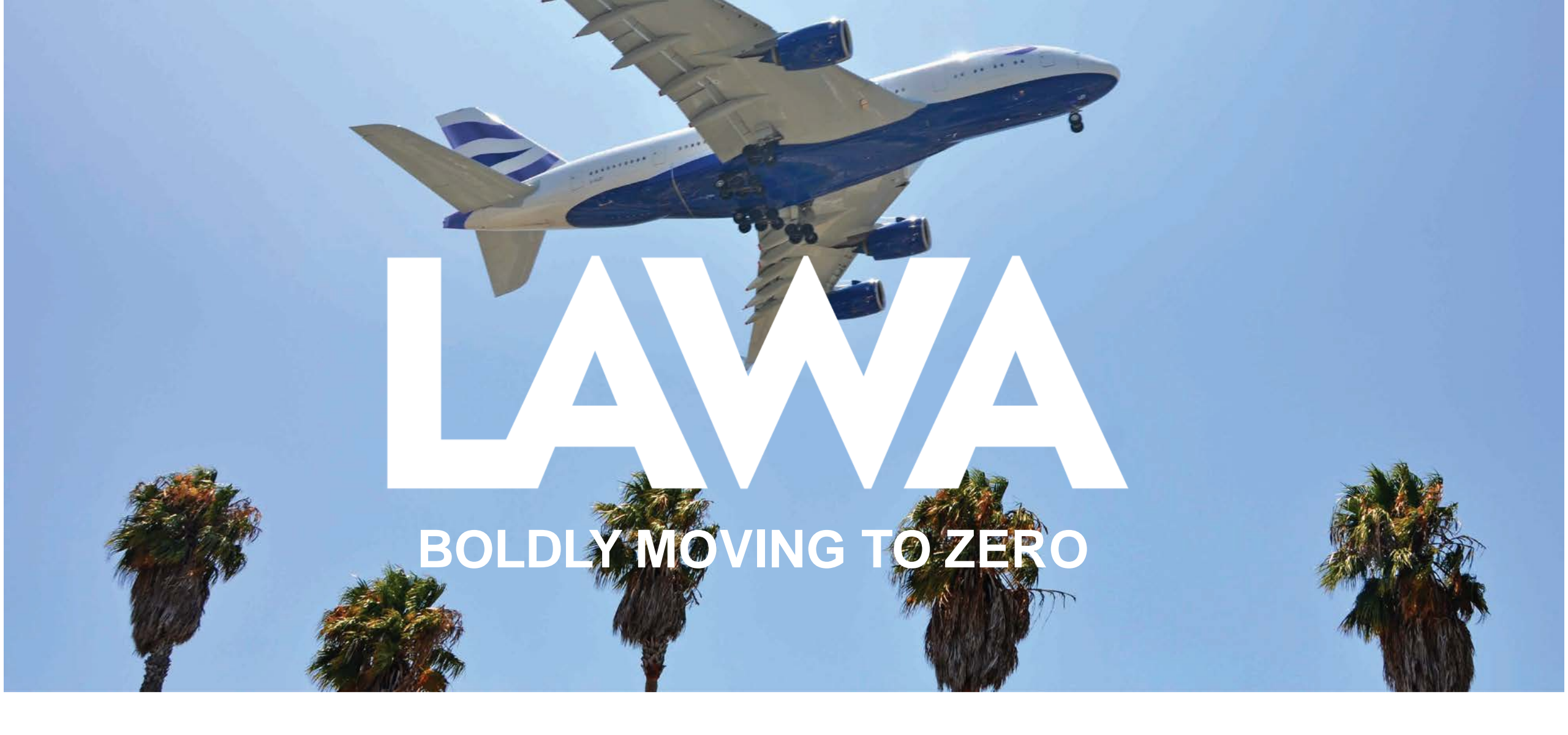
Year-End Progress Report on LAWA/AQMD MOU Implementation

Los Angeles World Airports December 2020