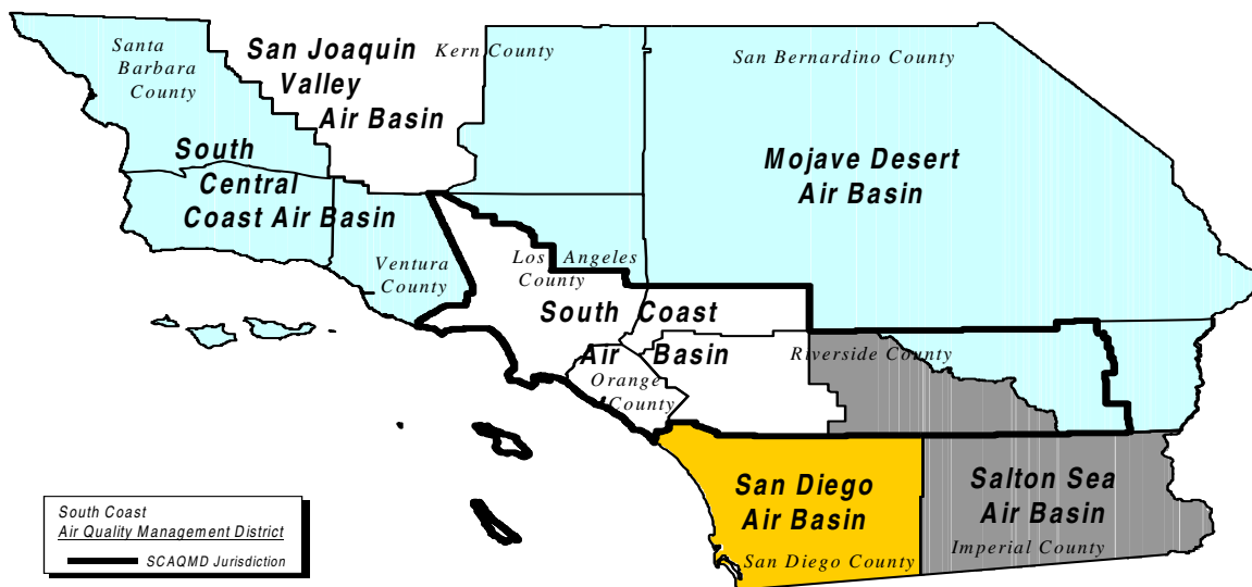
Figure 1-1 Boundaries of the South Coast Air Quality Management District

Riverside County and the SSAB and is bounded by the San Jacinto Mountains to the west and the eastern boundary of the Coachella Valley to the east (Figure 1-1).