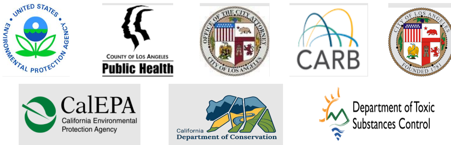
Figure 4-2: Examples of agencies that routinely collaborate with South Coast AQMD and CARB

CARB partners with local agencies to create memoranda of understanding (MOUs), such as an agreement with South Coast AQMD to enforce CARB’s greenhouse gas standards at certain types of facilities. In addition, CARB has already established partnerships with California DMV working on implementing registration holds for non-compliant trucks and buses, California Highway Patrol (CHP) to conduct roadside inspections, and other state and regional agencies to ensure the agencies are supporting each other’s enforcement efforts. Both South Coast AQMD and CARB have experience working in close collaboration with other regulatory agencies, cities and counties, public health agencies, and local police and fire departments to conduct investigations and provide public information about local air pollution sources.