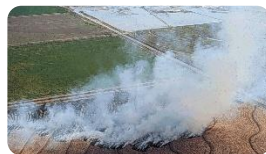
Figure A4-1: South Coast AQMD Enforcement Program

The Area Sources team focuses on emissions sources that are relatively common and widely distributed. Although each individual source may be small, together these sources have a substantial cumulative impact on air pollution. Examples include consumer paints and products (e.g., hairspray and home cleaning products), residential water heaters, and agricultural burning.