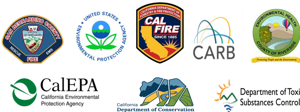
Figure 4-2: Examples of agencies that routinely collaborate with South Coast AQMD and CARB

CARB and South Coast AQMD are committed to working with other department agencies on joint initiatives that will directly result in cleaner air. The combined resources, expertise, and legal authorities of different agencies can create a well-rounded approach to the regulatory process that leverages their respective strengths to address issues that cumulatively impact public health. For example, the Los Angeles City Attorney’s Office partnered with South Coast AQMD to conduct inspections at specific facilities, including auto-body shops, in the City of Los Angeles.