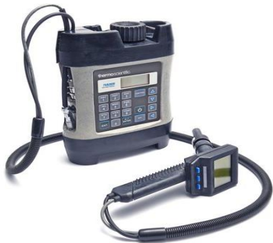
Figure 4-1: Portable instruments used by South Coast AQMD inspectors in the field

Toxic Vapor Analyzers (TVA): Inspectors can use TVAs to measure the level of certain gases in a specific area. This includes methane and volatile organic compounds (VOCs), which are emitted by petroleum sources and other types of sources.