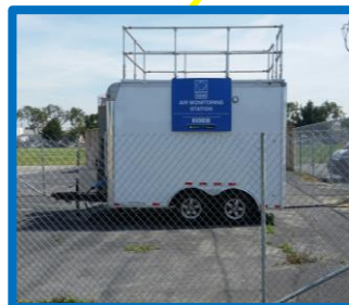
Huntington Park Air Monitoring Station (SELA)

Continuous measurements of multi-metals in PM10 August 2022 to Present