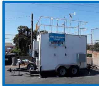
Resurrection Church Air Monitoring Station (ELABHWC)

MAD staff developed a novel multi-metals mobile platform to support the implementation of CAMPs in ELABHWC, SELA, and SLA communities.