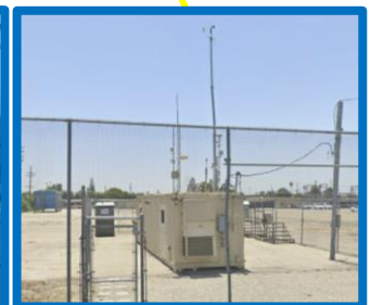
Compton Air Monitoring Station (SLA)

Continuous measurements of multi-metals in PM10 August 2022 to Present